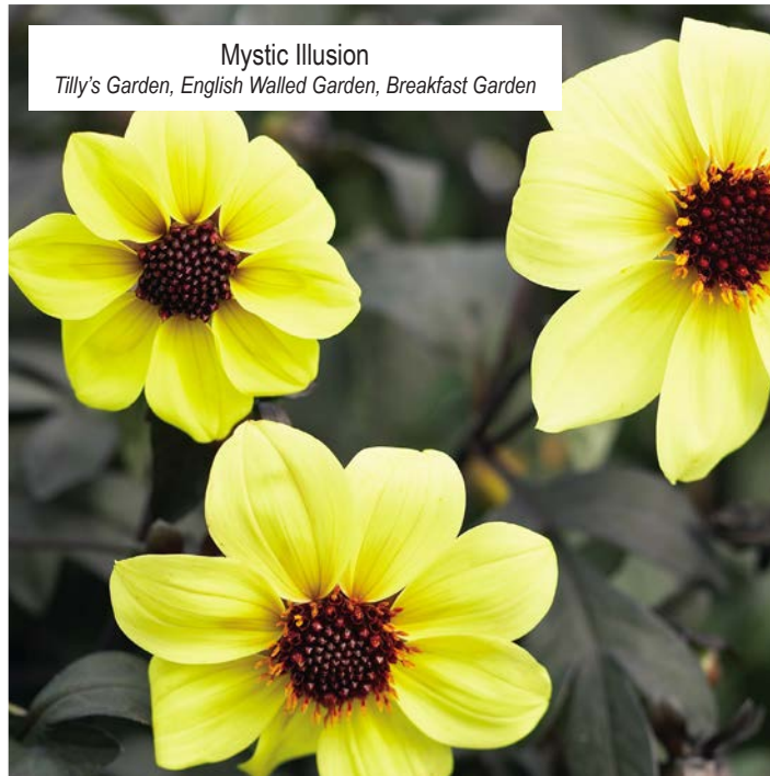
Mystic Illusion Tilly's Garden, English Walled Garden, Breakfast Garden