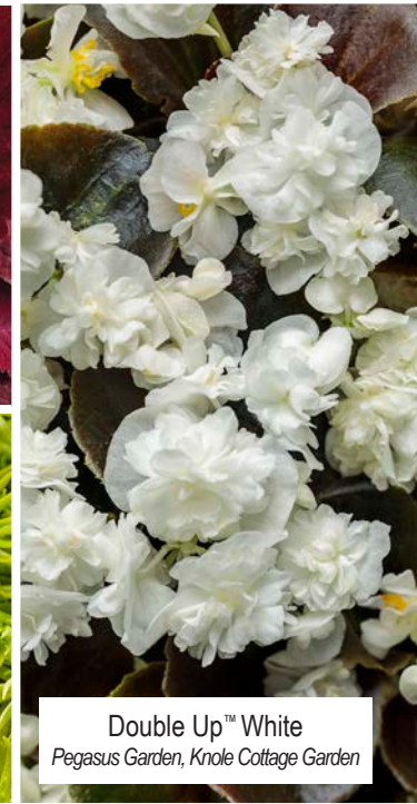
Double Up™ White Pegasus Garden, Knole Cottage Garden