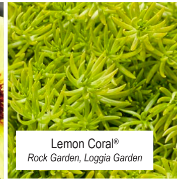
Lemon Coral® Rock Garden, Loggia Garden