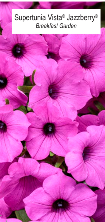
Supertunia Vista® Jazzberry® Breakfast Garden