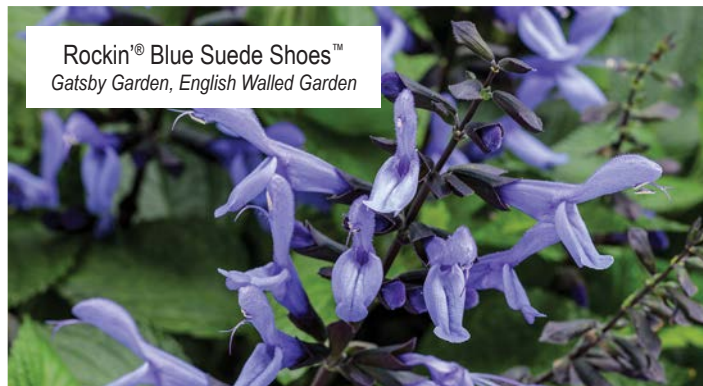
Rockin'® Blue Suede Shoes™ Gatsby Garden, English Walled Garden