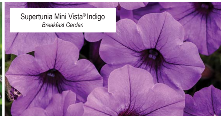
Supertunia Mini Vista® Indigo Breakfast Garden