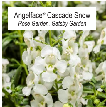
Angelface® Cascade Snow Rose Garden, Gatsby Garden