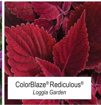
ColorBlaze® Rediculous® Loggia Garden