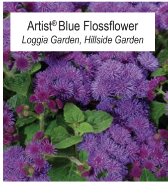
Artist® Blue Flossflower Loggia Garden, Hillside Garden