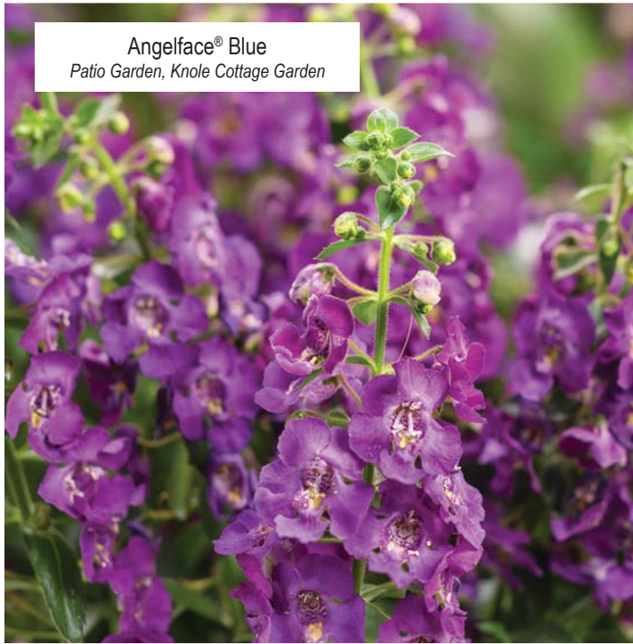
Angelface® Blue Patio Garden, Knole Cottage Garden

To learn more about each plant, visit provenwinners.com