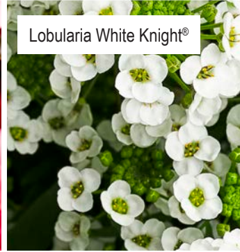
Lobularia White Knight®