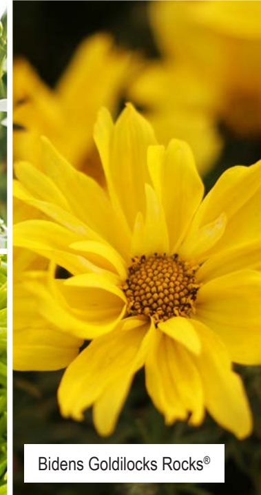
Bidens Goldilocks Rocks®