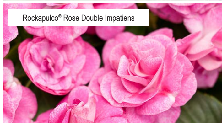
Rockapulco® Rose Double Impatiens