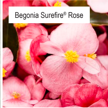
Begonia Surefire® Rose