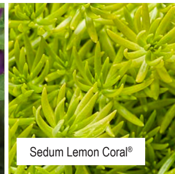
Sedum Lemon Coral®