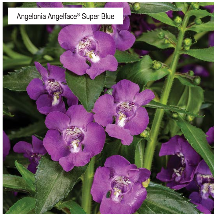
Angelonia Angelface® Super Blue