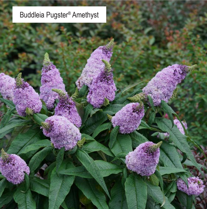
Buddleia Pugster® Amethyst