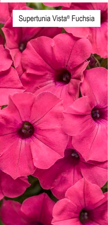
Supertunia Vista® Fuchsia