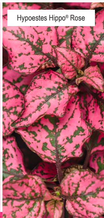
Hypoestes Hippo® Rose