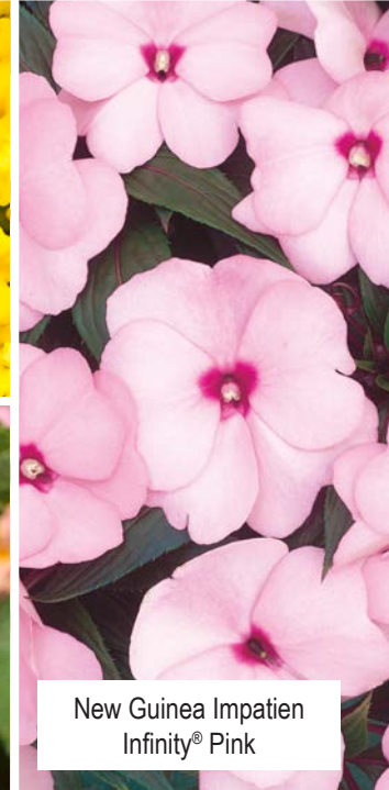
New Guinea Impatiens Infinity® Pink