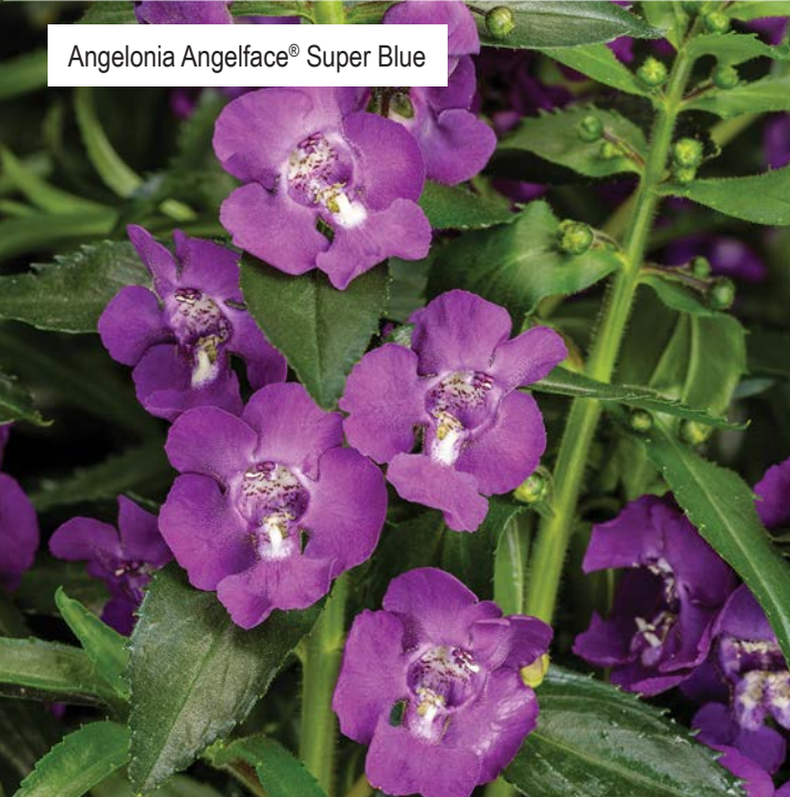
Angelonia Angelface® Super Blue