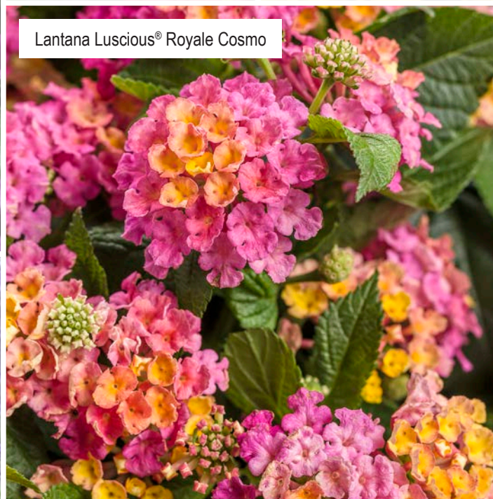
Lantana Luscious® Royale Cosmo