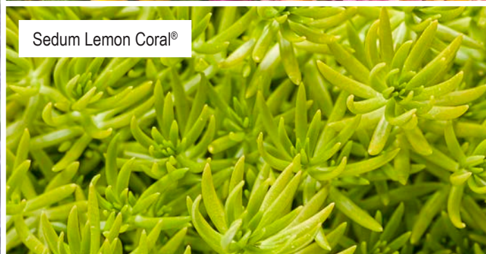
Sedum Lemon Coral®