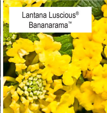
Lantana Luscious® Bananarama™