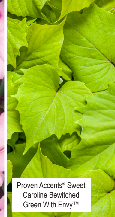
Proven Accents® Sweet Caroline Bewitched Green With Envy™