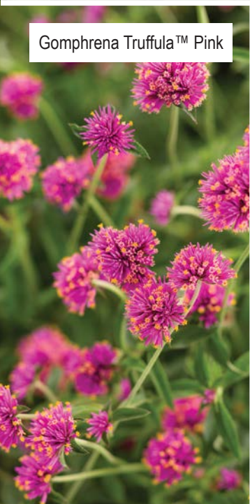
Gomphrena Truffula™ Pink