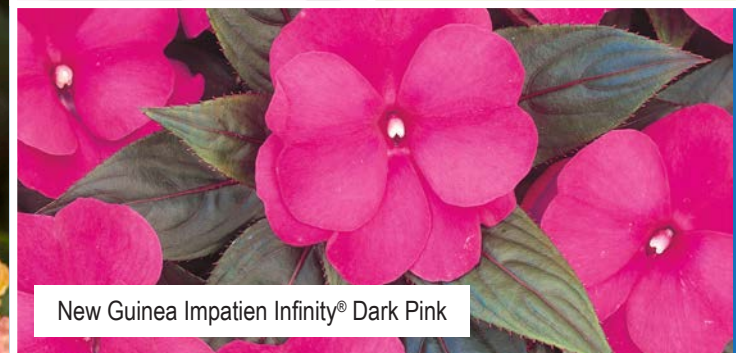
New Guinea Impatiens Infinity® Dark Pink