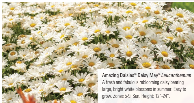
Amazing Daisies® Daisy May® Leucanthemum A fresh and fabulous reblooming daisy bearing large, bright white blossoms in summer. Easy to grow. Zones 5-9. Sun. Height: 12"-24".