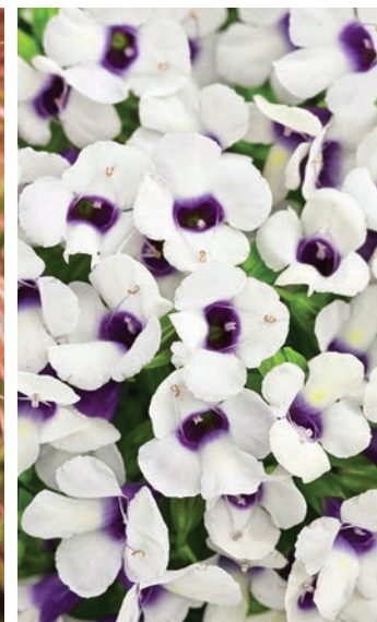
Catalina® Grape-o-Licious™ Torenia This versatile annual blooms in sun or shade all season. Use it as a bedding plant in landscapes or as a filler in containers. Zones 10-11. Sun-shade. Height: 8"-12".