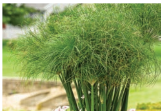
Graceful Grasses® Prince Tut™ Cyperus Grows quickly in water and landscapes. Finely textured plumes appear all season. Zones 10-11. Part sun to sun. Height: 18"-30".