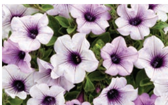
Supertunia® Trailing Blue Veined Petunia Long trailing or spreading stems are lined with plentiful blossoms all season. Zones 10-11. Part sun-sun. Height: 4"-8".