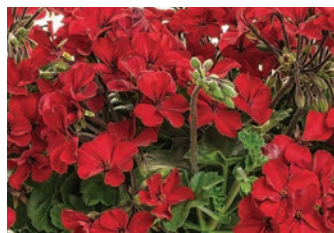
Timeless™ Fire Pelargonium Vibrant red blossoms appear on cascading plants all summer. Zones 9-11. Sun. Height: 12"-18".