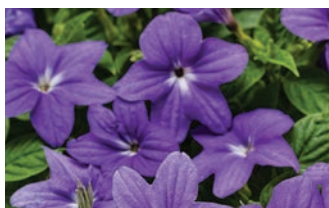
Endless™ Illumination Browallia This shade, heat and moisture loving annual with brilliant blue flowers is beautiful when planted en masse. Zones 9-11. Part shade-shade. Height: 12"-16".