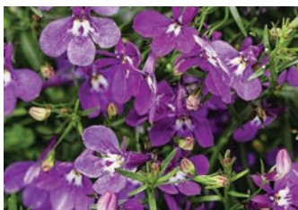
Lucia® Ultraviolet™ Lobelia Vivid violet purple flowers appear prolifically. Excellent in containers and landscapes. Zones 9-11. Part sun-sun. Height: 6"-12".