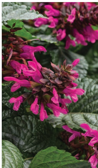
Rockin'® Fuchsia Salvia Fuchsia blossoms on robust plants attract hummingbirds and butterflies all season. Zones 9-11. Part sun-sun. Height: 24"-36".