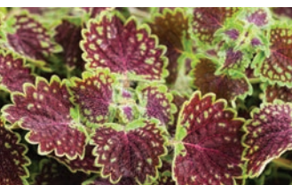
Chocolate Drop® Coleus This spreading, trailing coleus features deep burgundy leaves with lime edges. Zones 10-11. Sun-shade. Height: 14"-20".