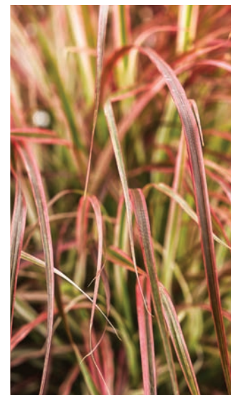
Graceful Grasses® Fireworks® Pennisetum This popular red and green striped grass with a fountain-like shape adds height and texture to containers and landscapes. Zones 9-11. Sun. Height: 24"-30".