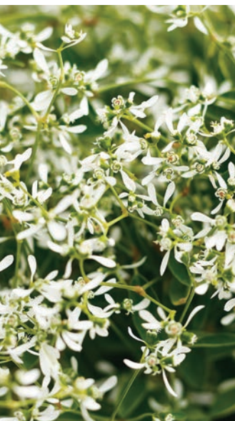
Diamond Frost® Euphorbia Tiny, white flowers dance above this airy textured, extremely heat and drought tolerant plant all season. Zones 10-11. Part sun-sun. Height: 12"-18".