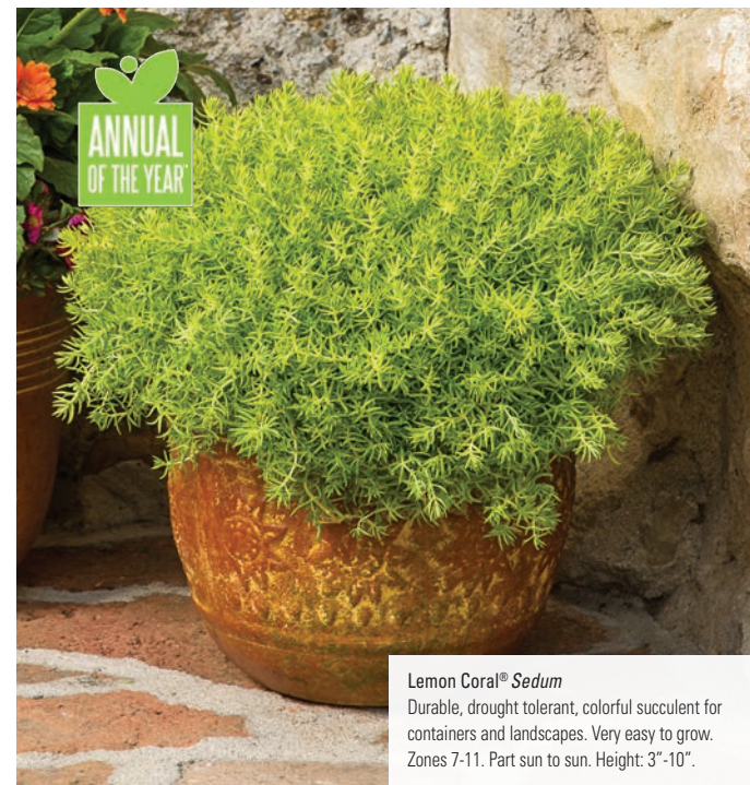
Lemon Coral® Sedum Durable, drought tolerant, colorful succulent for containers and landscapes. Very easy to grow. Zones 7-11. Part sun to sun. Height: 3"-10".