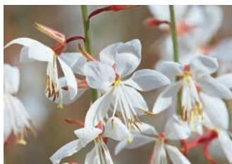
Stratosphere™ White Gaura Lovely in landscapes and as a thriller in containers, this perennial blooms nonstop all season on wispy stems. Zones 6-11. Sun. Height: 12"-24".