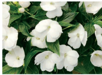
Infinity® White Impatiens Ideal for planting en masse or along the edges of flower beds, creating sweeps of bold color. Zones 10-11. Part shade-shade. Height: 10"-14".