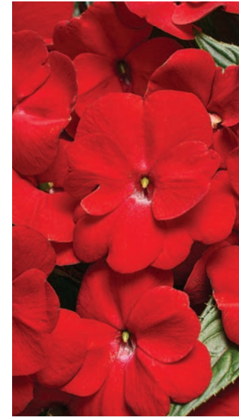
Infinity® Red Impatiens Ideal for planting en masse or along the edges of flower beds, creating sweeps of bold color. Zones 10-11. Part shade-shade. Height: 10"-14".