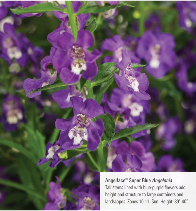
Angelface® Super Blue Angelonia Tall stems lined with blue-purple flowers add height and structure to large containers and landscapes. Zones 10-11. Sun. Height: 30"-40".

Located just outside The Greenbrier's North Entrance are beautiful gardens planted extensively with the exceptional plant varieties from Proven Winners, the nation's #1 plant brand. The garden has earned the prestigious designation as a Proven Winners Signature Garden – a showcase for the State of West Virginia!