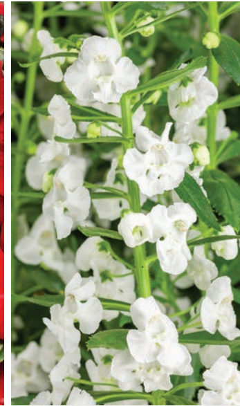
Angelface® Super White Angelonia An extra-large selection with tall stems lined with showy blooms. Ideal for hot, sunny landscapes. Zone 10-11. Sun. Height: 30"-40"