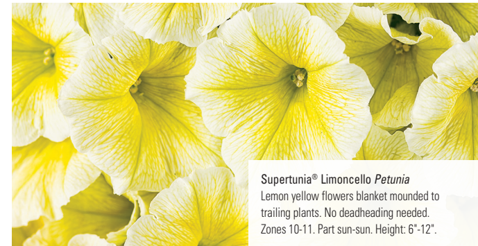
Supertunia® Limoncello Petunia Lemon yellow flowers blanket mounded to trailing plants. No deadheading needed. Zones 10-11. Part sun-sun. Height: 6"-12".