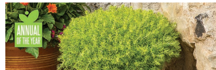
Lemon Coral® Sedum Durable, drought tolerant, colorful succulent for containers and landscapes. Very easy to grow. Zones 7-11. Part sun to sun. Height: 3"-10".