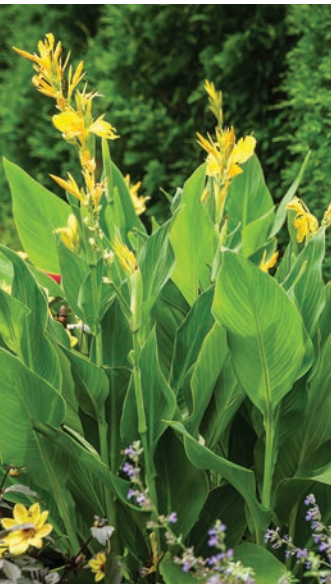
Toucan® Yellow Canna This canna lily will bloom all summer. It is very heat tolerant, and loves humidity. Zones 8-11. Part sun-sun. Height: 30"-48".