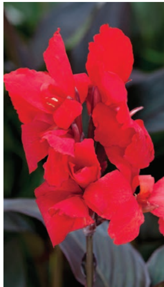
Toucan® Scarlet Canna Fire engine red flowers stand at attention above the bold, dark foliage all summer. Zones 8-11. Part sun-sun. Height: 30"-48".