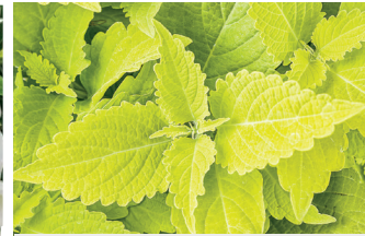
ColorBlaze® Lime Time® Solenostemon This large-sized coleus shines in containers and landscapes; complements every other color in combinations. Zones 10-11. Sun-shade. Height: 24"-40".