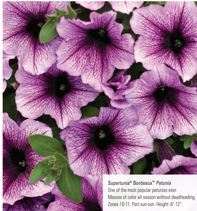
Supertunia® Bordeaux™ Petunia One of the most popular petunias ever. Masses of color all season without deadheading. Zones 10-11. Part sun-sun. Height: 6"-12".